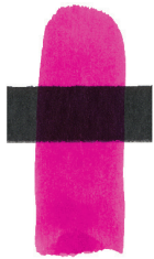
Carmine 3080F.CAR Semi-Transparent

Not only are these inks ideal for use with Koh-I-Noor technical pens, but they can also be used with air-brushes, crowquill pens, and paint brushes. Cleans up easily with the Koh-I-Noor pen cleaner and Rapi-doeze® pen cleaner system. The 1 oz. size has a convenient dropper spout ideal for filling technical pens and art markers. The larger size bottles of black ink have a flip up spout for controlled filling and mixing applications.