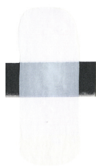
White 3080F.WHI Semi-Opaque

Printed swatches may not be a true representation of the actual color.