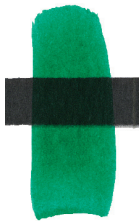
Green 3080F.GRE Semi-Transparent