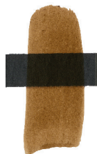
Brown 3080F.BRO Semi-Transparent