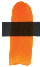
Orange 3080F.ORA Semi-Transparent