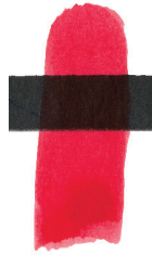
Red 3080F.RED Semi-Transparent