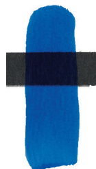
Blue 3080F.BLU Semi-Transparent